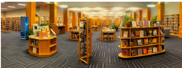
Updated May 2025

Get homework and studying help from a professional tutor any time you need it. This is provided at no cost to eligible military members and their families. Tutors are online 24/7 and available to help in more than 150 subject areas. Go to daf.dodmwrlibraries.org/databases located under the “Children’s Corner” page [Requires authentication]